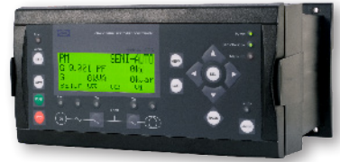
Automatic Genset Controller, AGC-4